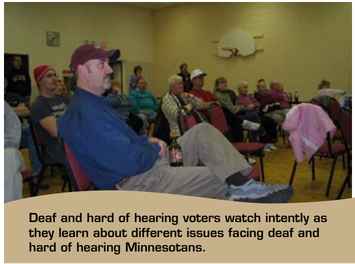
Deaf and hard of hearing voters watch intently as they learn about different issues facing deaf and hard of hearing Minnesotans.