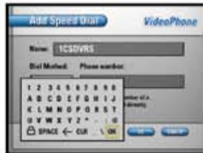
Step 4 • Add Speed Dial: In the Name box, press "Enter" and use arrows to select letters or numbers.