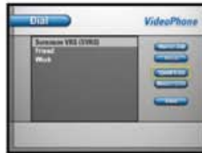
Step 2 • Dial List: Select "Speed Dial"