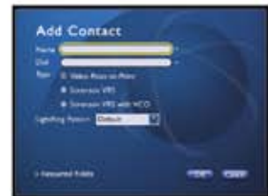
Step 3 • Add Contact: Select "Name"