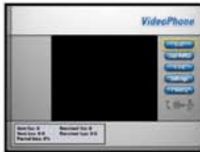
Step 1 • Main Menu: Select "Dial"