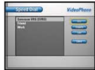
Step 3 • Speed Dial List: Select "Add"