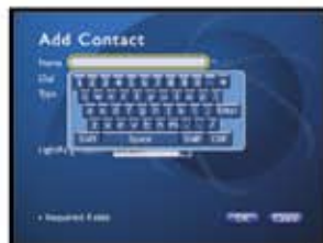
Step 4 • Add Contact: In the Name box, press "Keyboard" and use arrows to select letters or numbers.