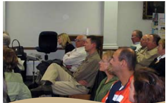
Deaf and hearing Faribault residents look on as candidates present their viewpoints at a candidate forum.

MADC then co-sponsored, with Faribault's American