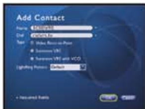
Step 5 • Add Contact: Enter the information Name: 1CSDVRS Dial: csdvrs.tv Type: Video Point-to-Point Select "OK"