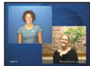
Step 7 • Using CSDVRS: Connect with CSDVRS!