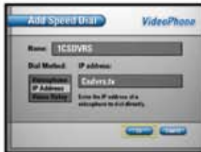
Step 5 • Add Speed Dial: Enter the information Name: 1CSDVRS Dial Method: IP Address IP Address: Csdvrs.tv Select "OK"