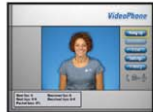
Step 8 • Using CSDVRS: Connect with CSDVRS!

We can come to your home or office to help!