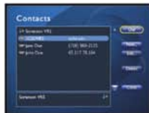
Step 6 • Contacts: Select "1CSDVRS" to call CSDVRS!