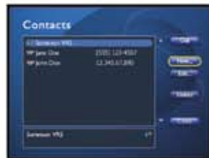
Step 2 • Contacts: Select "New..."