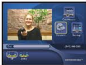
Step 1 • Main Menu: Select "Contacts"