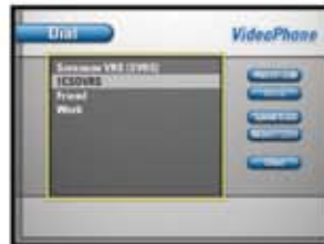
Step 6 • Using CSDVRS: Select "1CSDVRS" to call CSDVRS!